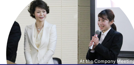
At the Company Meeting