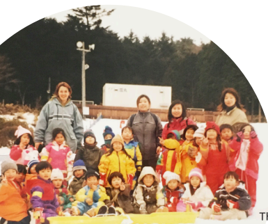
The tradition of going on a snow excursion had started all that time ago!