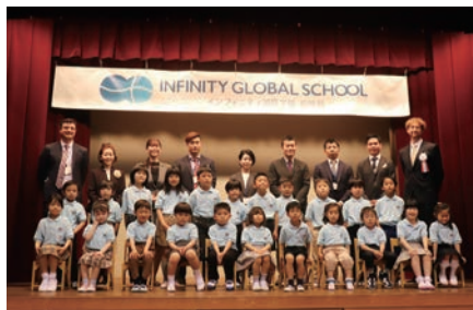
Memorable first-year enrolled students