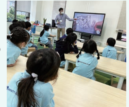
ICT lessons on the electronic blackboard