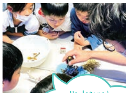
We learned about the ecology and role of coral and experienced coral transplanting.