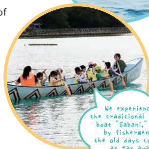
We experienced the traditional fishing boat "Sabani," used by fishermen in the old days to fish as far away as Southeast Asia!